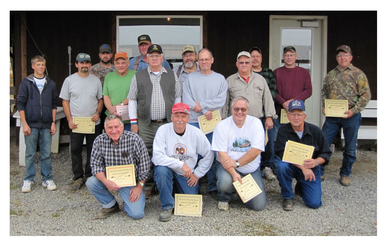
Winners of the October BPCR Match