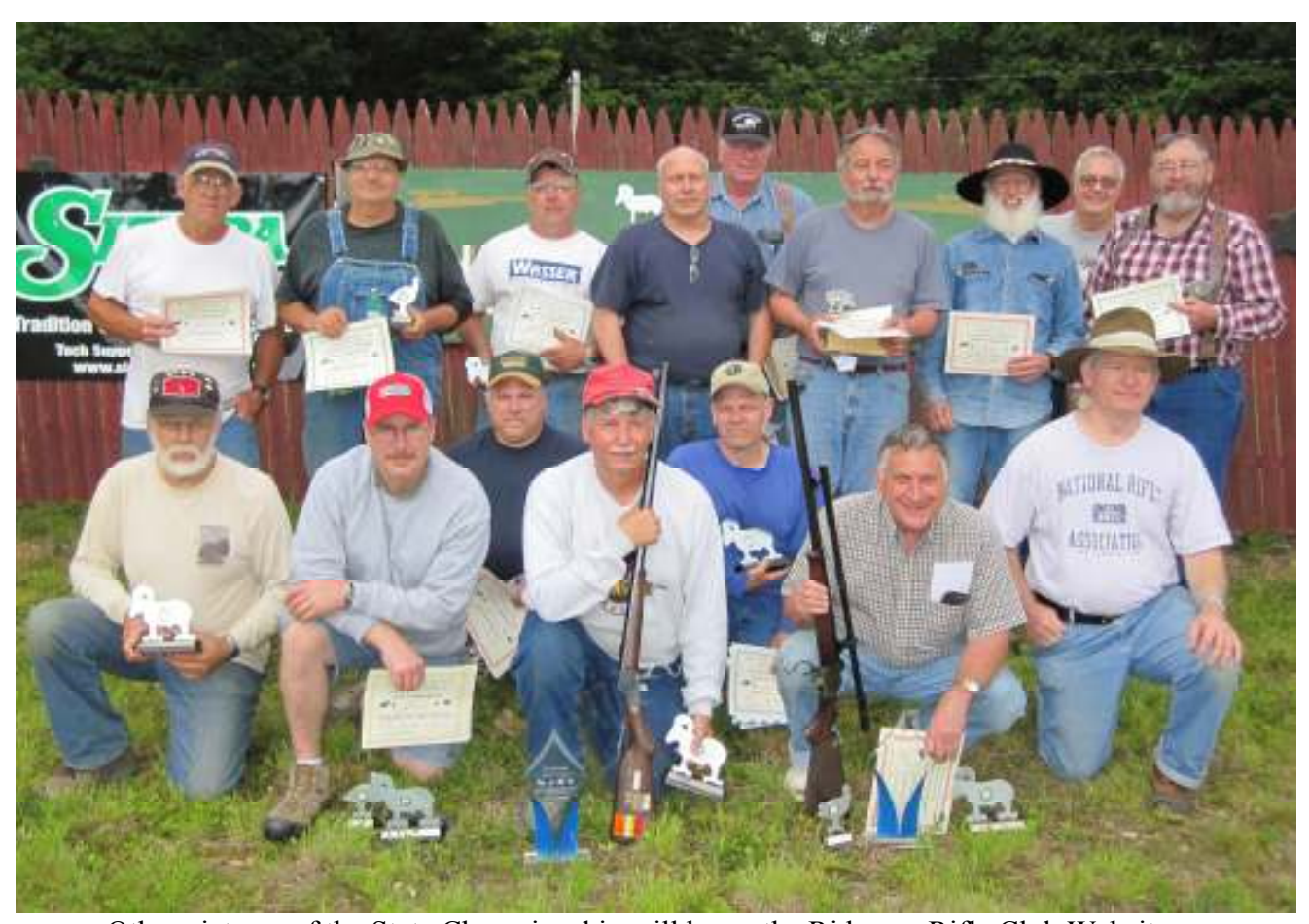
Other pictures of the State Championship will be on the Ridgway Rifle Club Website.