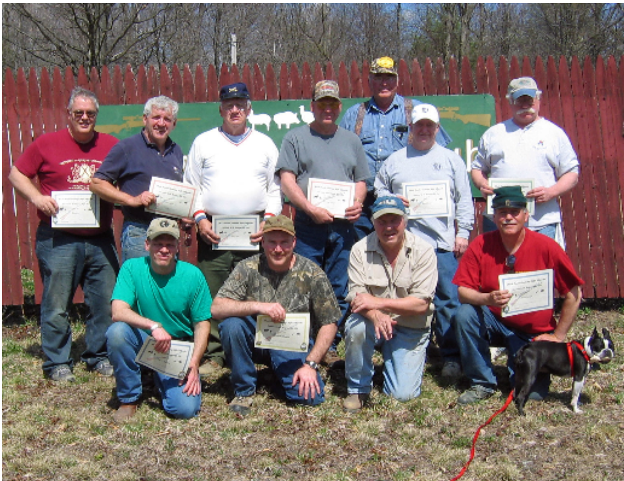
Winners April 2009 BPCR Silhouette