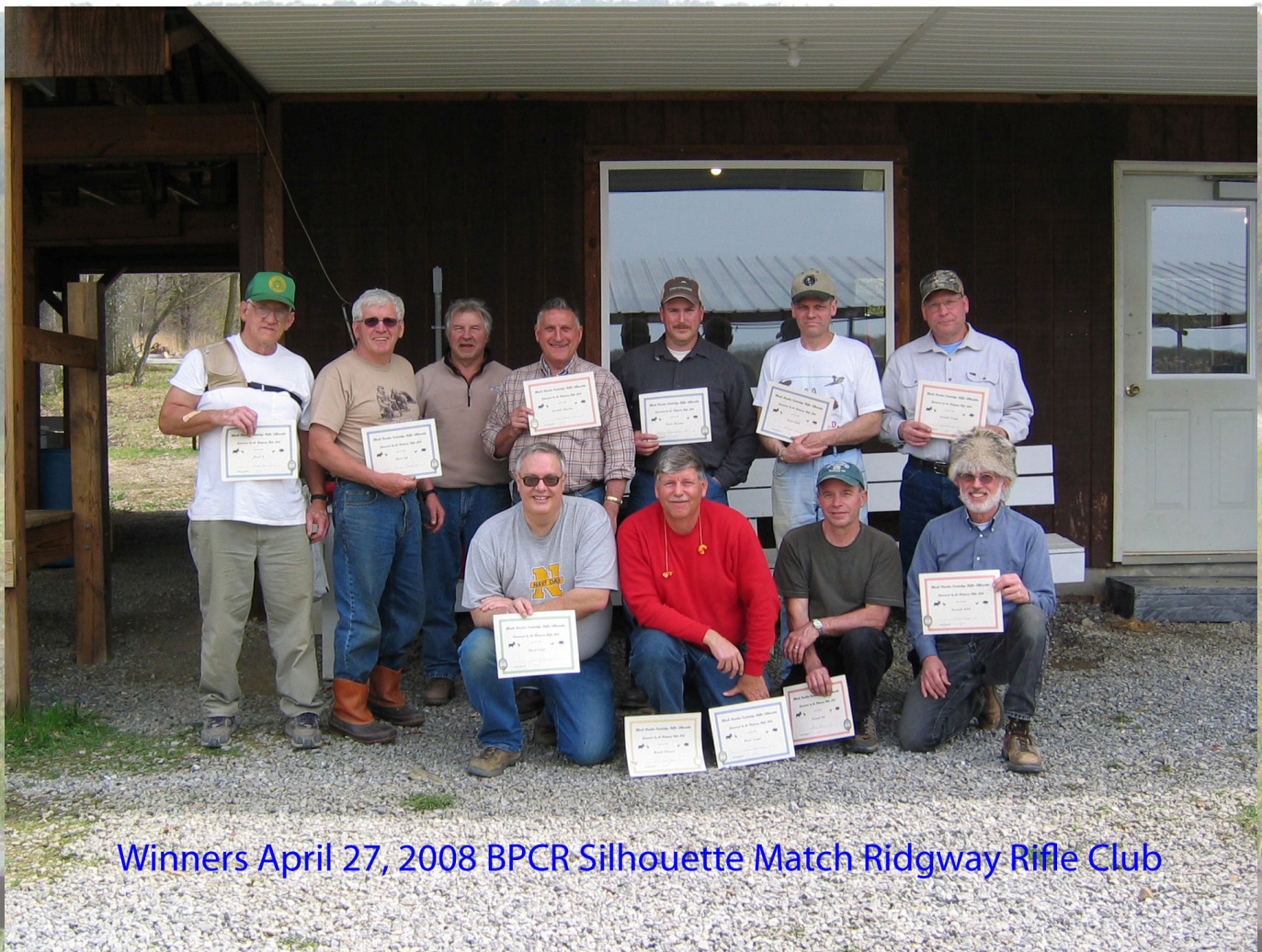
Winners April 27, 2008 BPCR Silhouette Match Ridgway Rifle Club