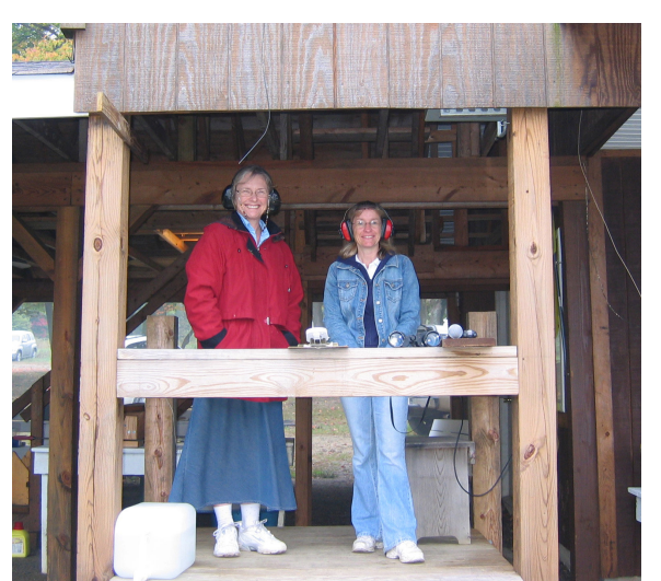
Relay calling can be fun!

There were 44 attendees at this regional match held at the Ridgway Rifle Club in Ridgway, Pa., representing 10 States. Although we didn't see much sunshine during the two days in Ridgway, it was still a very nice fall weekend in the picturesque countryside with the leaves starting to turn to their autumn shade of yellows and reds