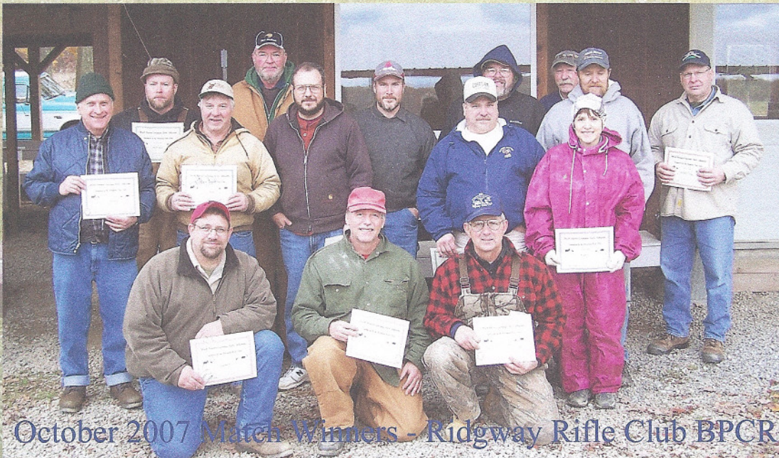
October 2007 Match Winners - Ridgway Rifle Club BPCR