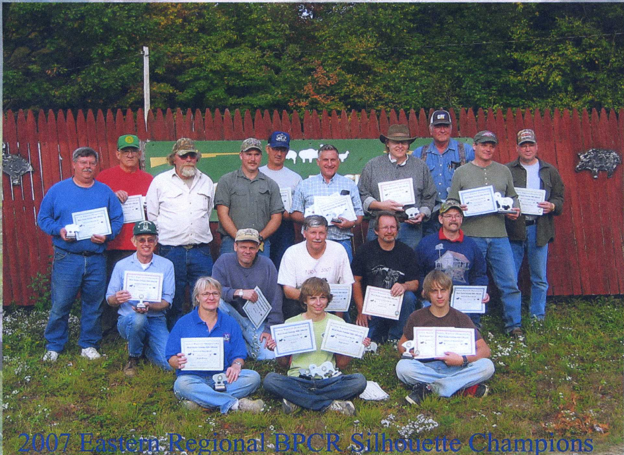
2007 Eastern Regional BPCR Silhouette Champions