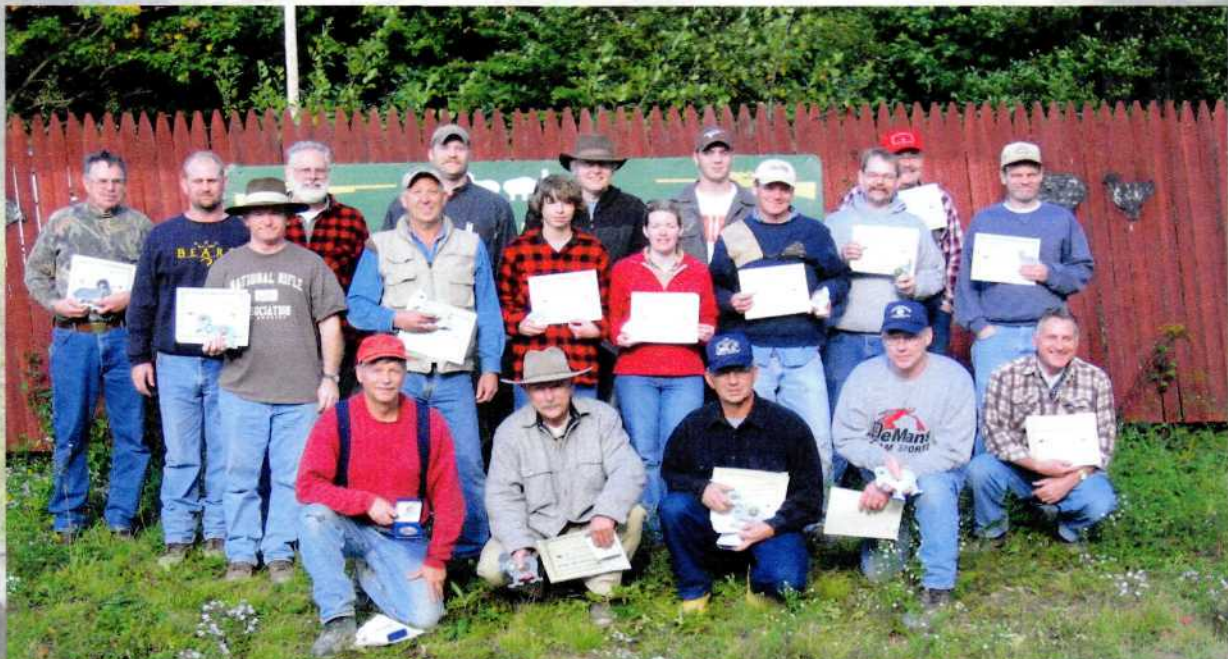
2006 BPCR Silhouette Eastern Regional Championship Winners